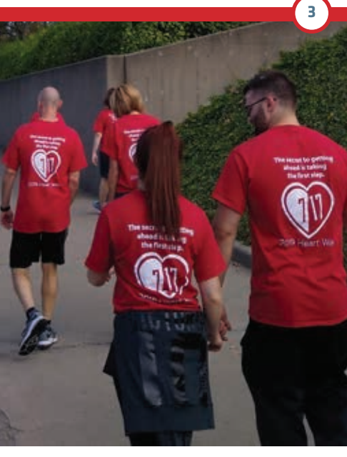
Above: 7 17 employees and their families participate in the American Heart Association's Heart Walk.